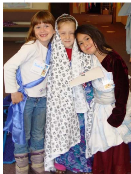
The Toga Shop was always a favorite!