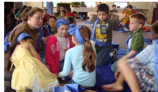
Family groups were identified by colored sashes, and spent the week learning and growing together