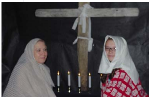
Christians in the Underground Church show God's love even in tough places.