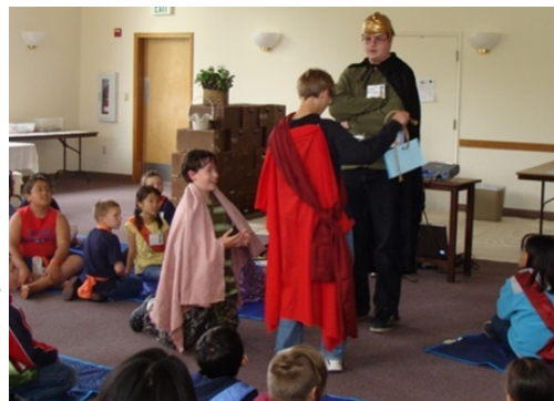
One night the kids watched as a Roman Senator publicly frees a slave, and teaches that God's love is given freely to us.

Visit the marketplace and see the scribes, the food vendors, or the toga shop. Go along the streets and see Roman Centurions leading a prisoner, shutting down a shop owned by Christians, or simply looking intimidating! Visit Paul under house arrest, and learn about God's love. Or, you can visit an underground church—where Christians worship in hidden places to keep from persecution.