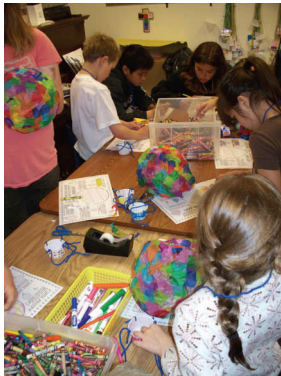
VBS Participants make paper balloons

It has been a bit since we've written, and so much is going on. We hope that you have had a blessed summer, that the fall has offered some times of respite in busy-ness, and that you prepare excitedly for the coming welcome of the Christ child.