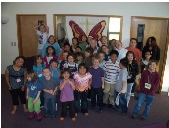
A few of the kids of Kids Night Out

Perhaps in the church of Christ we have the best option to offer— "Above all, clothe your-