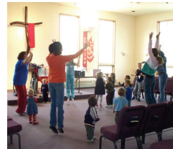
Children 'Lift Off' during VBS

we continued in Genesis and explored how God gave people choices—and how so often we make bad choices, but God still loves us. As we move into November, we start with Abraham, and how God calls us to be in relationship. We are now getting more than 50 on a regular basis, with a number of new faces—both kids and helpers.