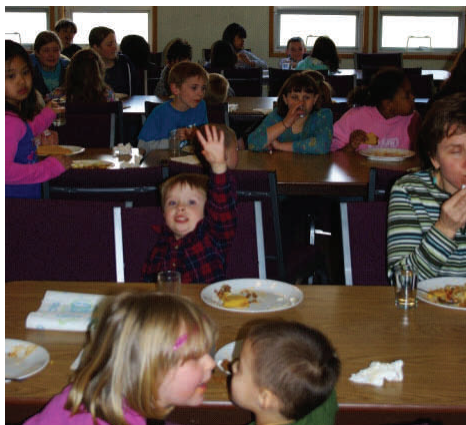
Every Wednesday begins with a great meal prepared by volunteers & served by kids

As we finish up another year of Kids Night Out, we look back over a great year. Perhaps the best way to show you how the year has gone would be to share some of the photos of the ministry.