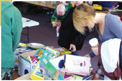
Individuals sort through children's books

This is always a great opportunity to meet members of the community, and connect in new ways.