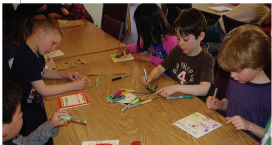
Tiles are used to make trivets for Mother's Day

Prayer Point Please pray with us that God's presence continue with the kids through the summer, and that we will see many of them at VBS, as well as next fall.