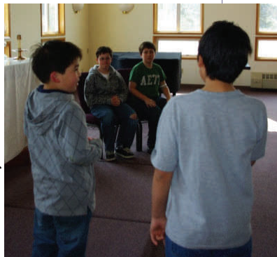
'Peter and John' defend themselves in front of the judges

at the front. It was a reminder to us that we could not assume anything about what these kids know, and that the very basics of the Christian faith need to be emphasized all the time. It also became an excellent opportunity to remind everyone why we celebrate Christmas—because God loved us so